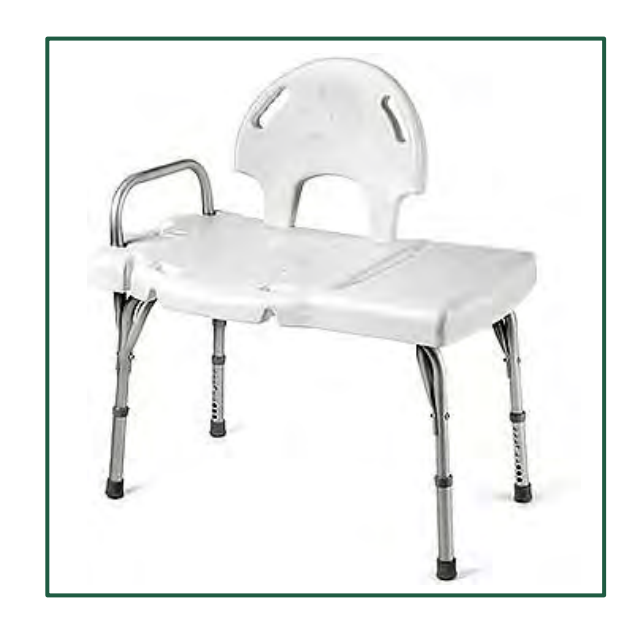
Shower Chair / Bench (Intended for Shower Stalls)